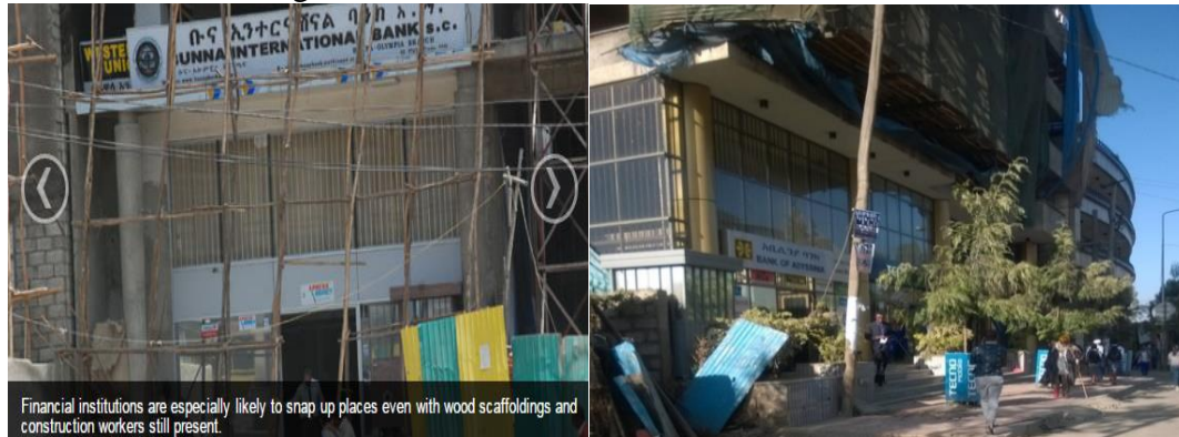
Figure 4.2 Rented Buildings under Construction

and directives, prefer fine instead of waiting for the inspectors, prefer to rent the ground floor to get money and finalize other floors, violate the standard and agreement and construct by their new design, prefer to get the service illegally and misunderstanding about the inspectors' visit and believed not for the quality of the construction. The following figure shows the rented under construction buildings.