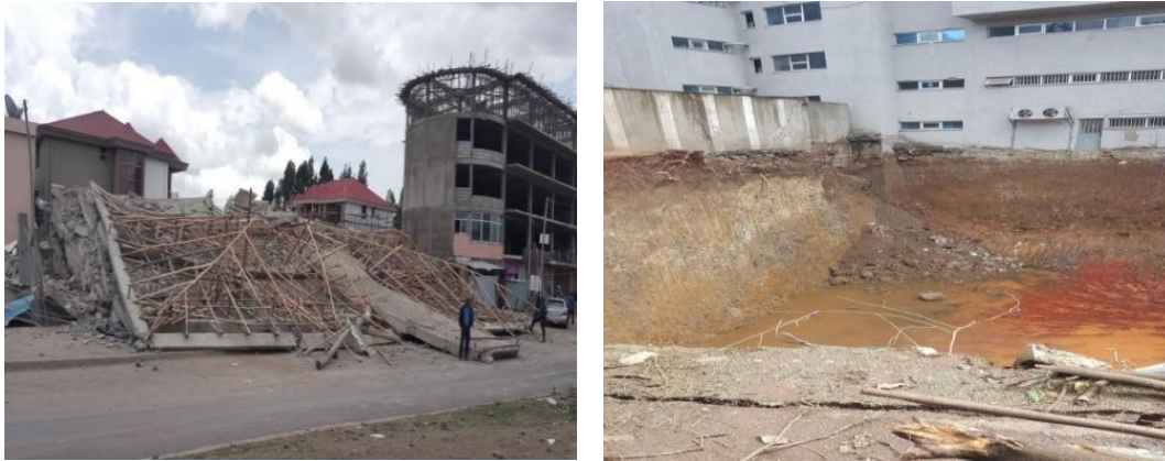
Figure 4.3: Impact of Improper Construction Inspection

out of these, more than 30 percent of building construction time already terminated, again 185 constructing building owners paid a large amount of fine, and also some constructing buildings fallen and created problems in their surroundings. One can easily observe and understand from the following table and pictures how the poor inspection and mistakes from service seekers affect society.